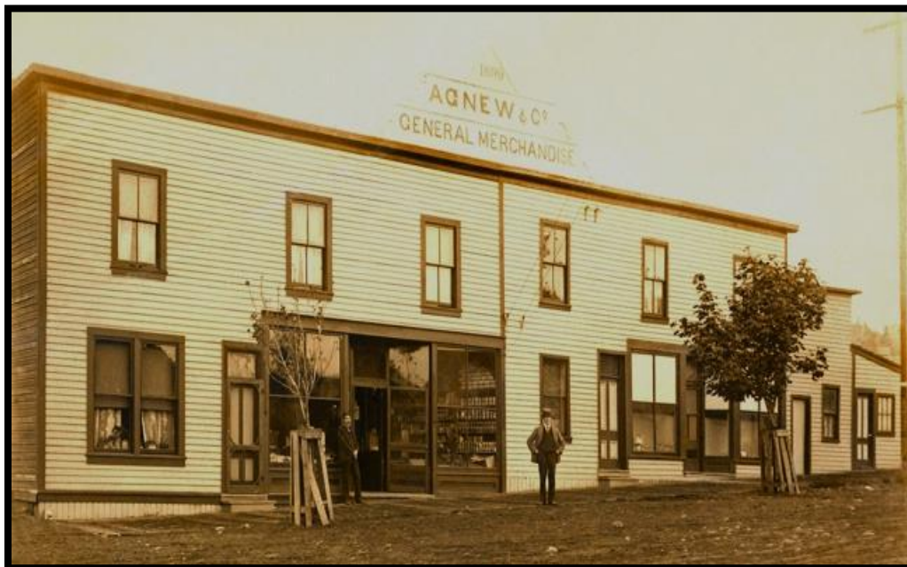
Agnew & Co. 1901