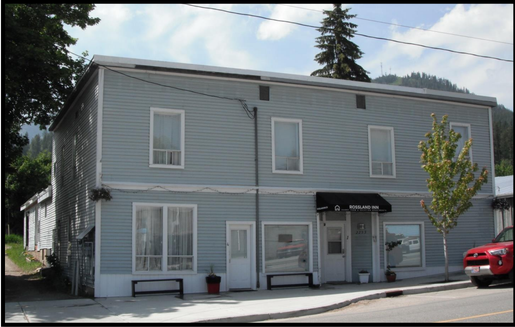
Agnew & Co. 2018